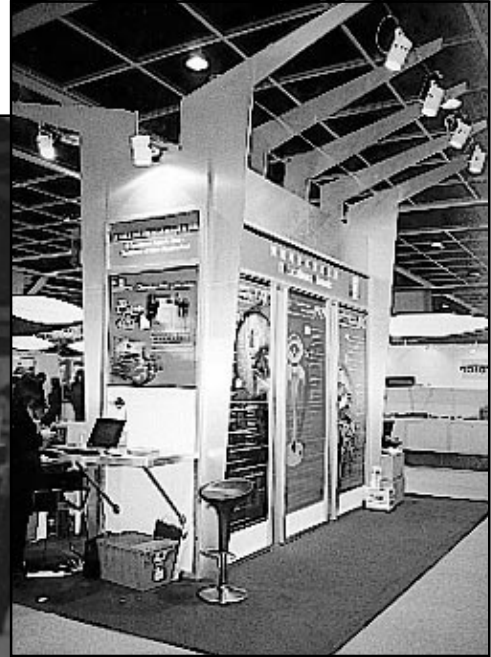
The HKCS Booth at the Hong Kong Information and Infrastructure Expo 2001 from 22-25 February 2001.

HKCS was a supporting organization of Hong Kong Information Infrastructure Expo 2001 from 22-25 February 2001 to help promoting the development of IT in Hong Kong. Same as the previous years, HKCS was one of the exhibitors in the Expo, this provided the opportunity for our Society to interact with the IT vendors and the Public.