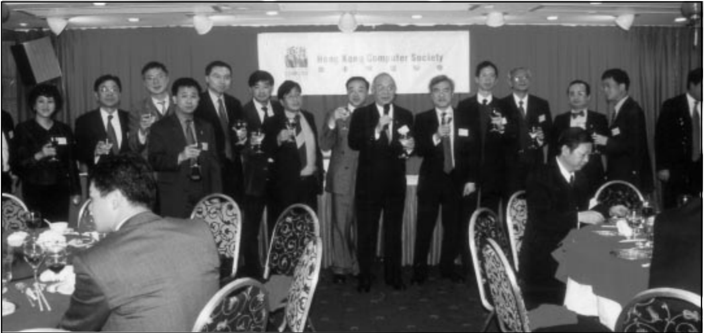
HKCS Council Members & Fellows wishing all members & guests have a prosperous year ahead.